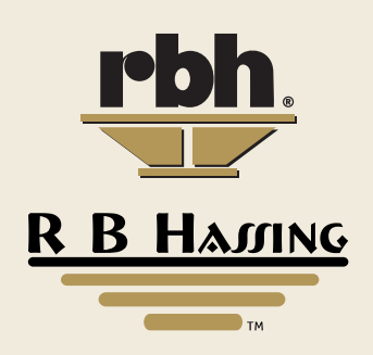
High Performance Home Audio Redefining the Way You Experience Sound™

*Warranted for 5 (five) years from date of purchase to be free from defects and workmanship. For more information see your RBH dealer.