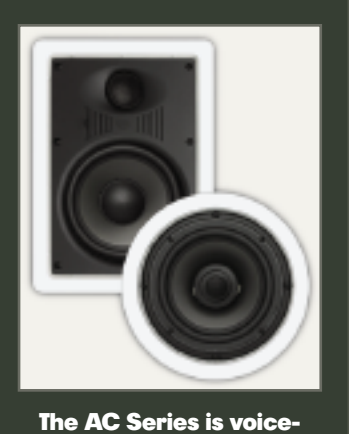
matched to the RBH A-Series in-wall and in-ceiling speakers for ultimate system flexibility.

Managing the drivers is an extensive crossover network which uses high-quality parts. Many hours of research and computer modeling went into the crossover designs for this system to ensure the proper integration of each driver for a seamless sonic presentation. The number of components and overall cable lengths were kept to a minimum to help provide a smooth, uniform response. The AC Series also employs fast and efficient tweeter protection circuitry. The combination of these features guarantees many years of reliable, trouble-free service.