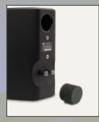
Rear Panel Features: Threaded inserts for bracket mounting

Visit a dealer today to let the Architectural Series provide you with an utterly compelling listening experience and redefine the way you experience sound.