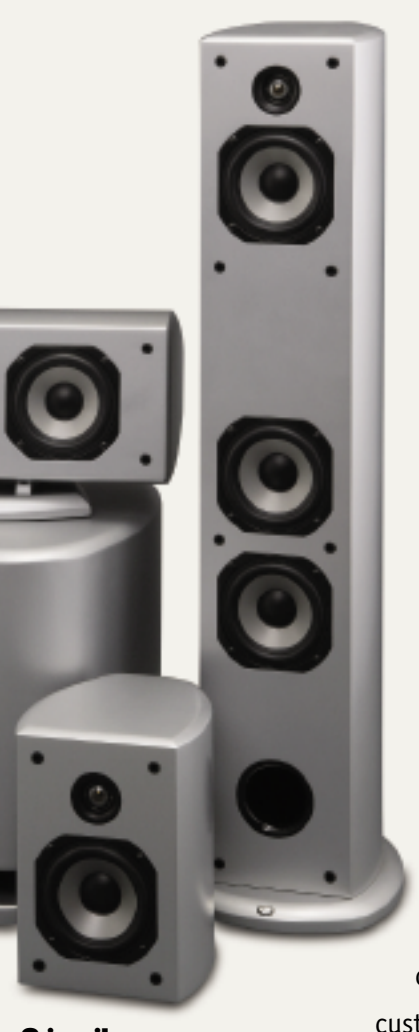
m 2 in silver