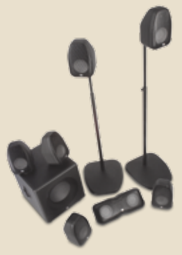
CT-7.1 System The CT-7.1 adds an additional pair of MM-4 satellite speakers so homeowners can take advantage of exciting new surround sound processing schemes like Dolby Digital EX and dts-ES Discrete and other matrixed 8-channel surround sound modes.

CT-5.1 System At RBH, we understand not everyone is prepared to take the plunge into seven-channel surround sound or may not yet have the equipment to support a system of this caliber. For this reason, we also offer a standard CT-5.1 system that boasts the same build quality and materials as its sophisticated counterpart. The CT-5.1 system consists of four MM-4 satellite speakers, one C-4 center speaker and one MS-8.1 powered subwoofer.