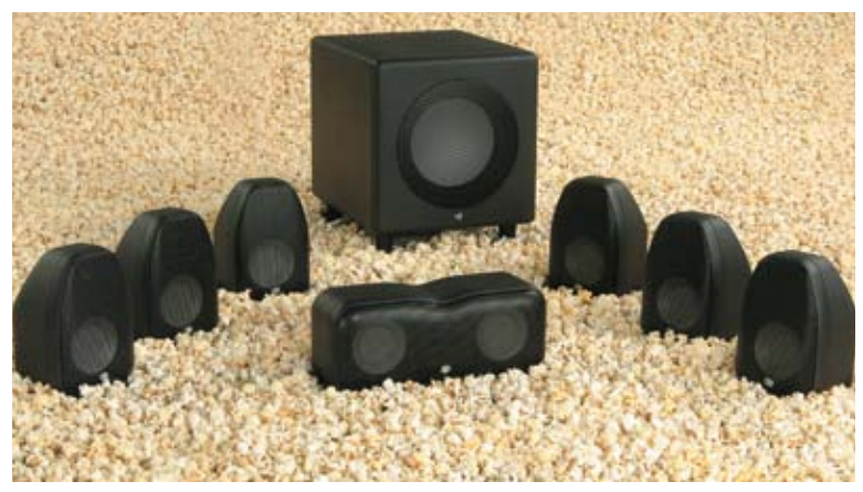
The Compact Theater systems are unlike any "mini" home theater speaker systems currently on the market. With new surround sound formats like Surround EX and dts-ES Discrete, we decided to create an affordable and easy speaker solution. The standard 5.1 system is comprised of four MM-4 satellite speakers for main and surround channels, one C-4 center speaker and an MS-8.1 subwoofer. Just by adding another pair of MM-4's, you can easily upgrade at a later date to a 7.1 system, or purchase the complete 7.1 package and immediately enjoy the sonic benefits of a totally integrated and matched eight-speaker system.

RBH's exclusive Tuned Aperiodic Vent (TAV<sup>™</sup>) technology (found in the MS-10.1) allows increased performance from its smaller cabinet volume. TAV<sup>™</sup> provides better low frequency extension and efficiency than a similar sized sealed system.