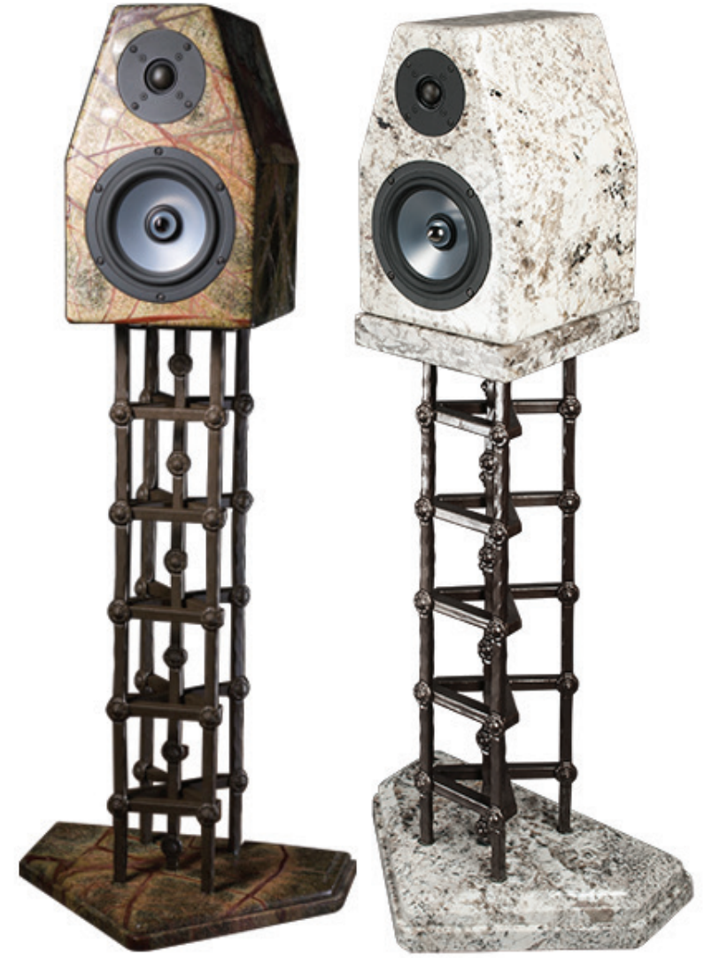
The Voce Fina and speaker stand shown here are Rainforest Green granite.

Status Acoustics Layton, Utah - USA +1-801-543-2200 / statusacoustics.com