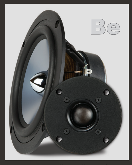
Proprietary Beryllium alloy midrange woofer and Scan-Speak soft fabric dome tweeter are used due to their incomparable performance.

The Voce Fina is no ordinary speaker system; gone are traditional building materials, methods and components. The Voce Fina elegantly brings together award-winning craftsmanship with the finest materials and components money can buy. Due to its unique design, the Voce Fina is capable of presenting its listeners with unaltered, pure musical fidelity, the ultimate goal of any audiophile.